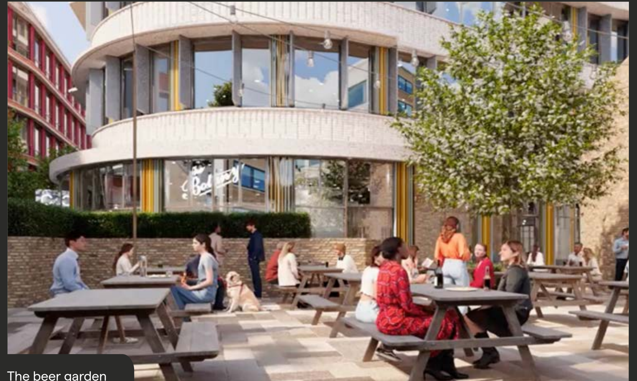
The beer garden