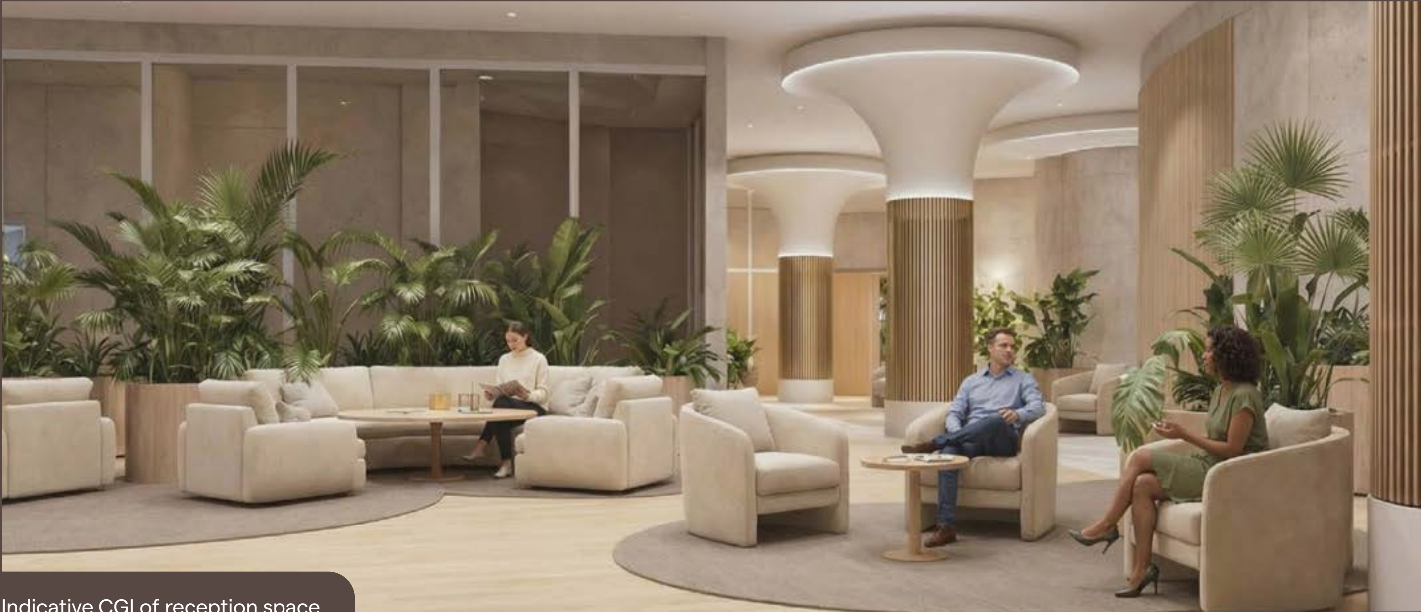
Indicative CGI of reception space