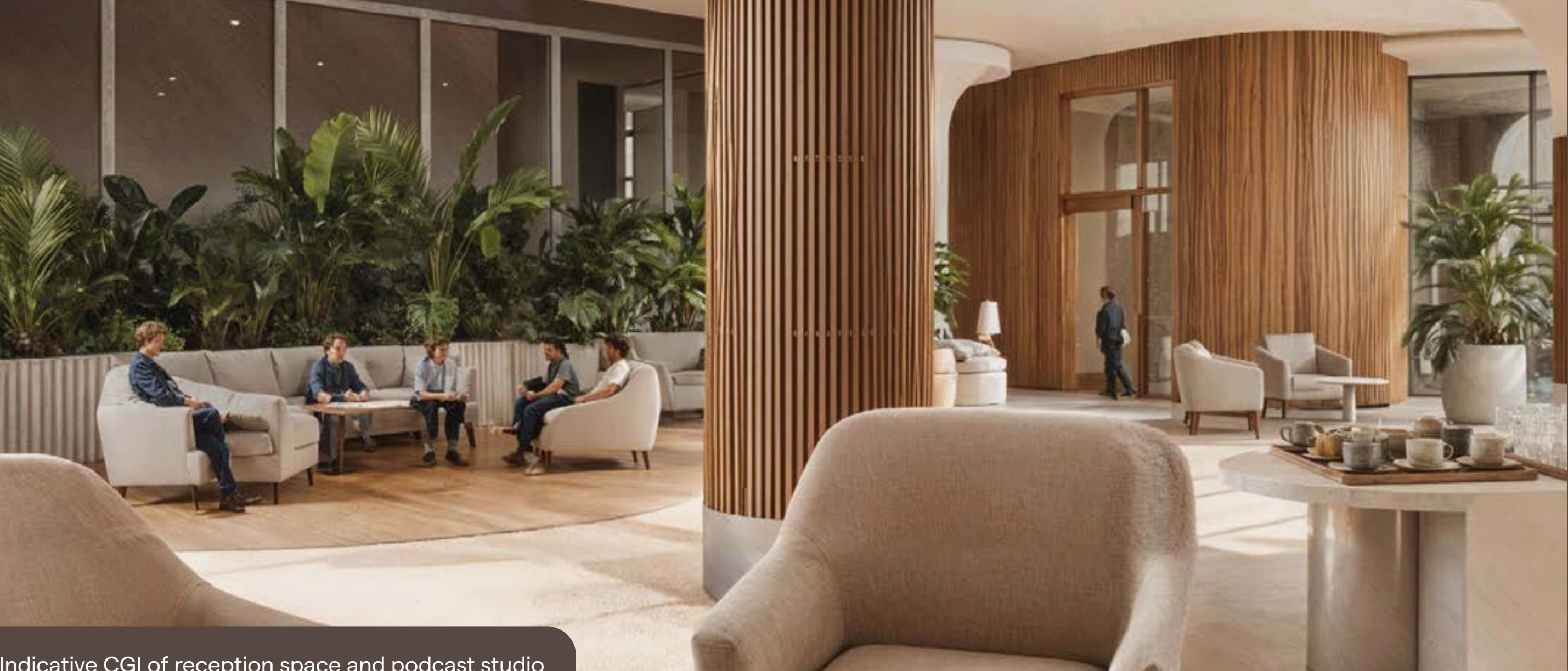
Indicative CGI of reception space and podcast studio

The future of work is built around its people