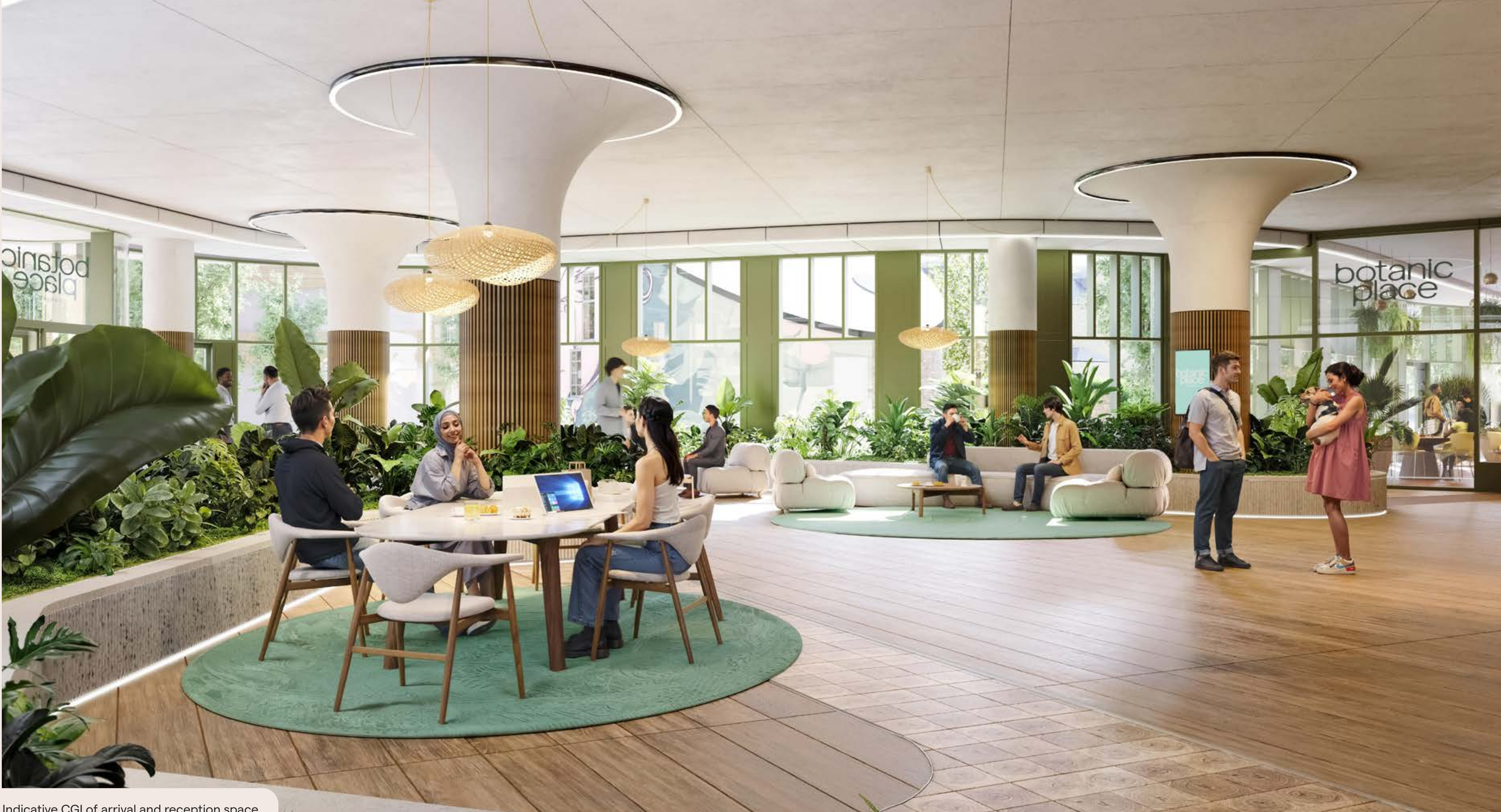
Indicative CGI of arrival and reception space