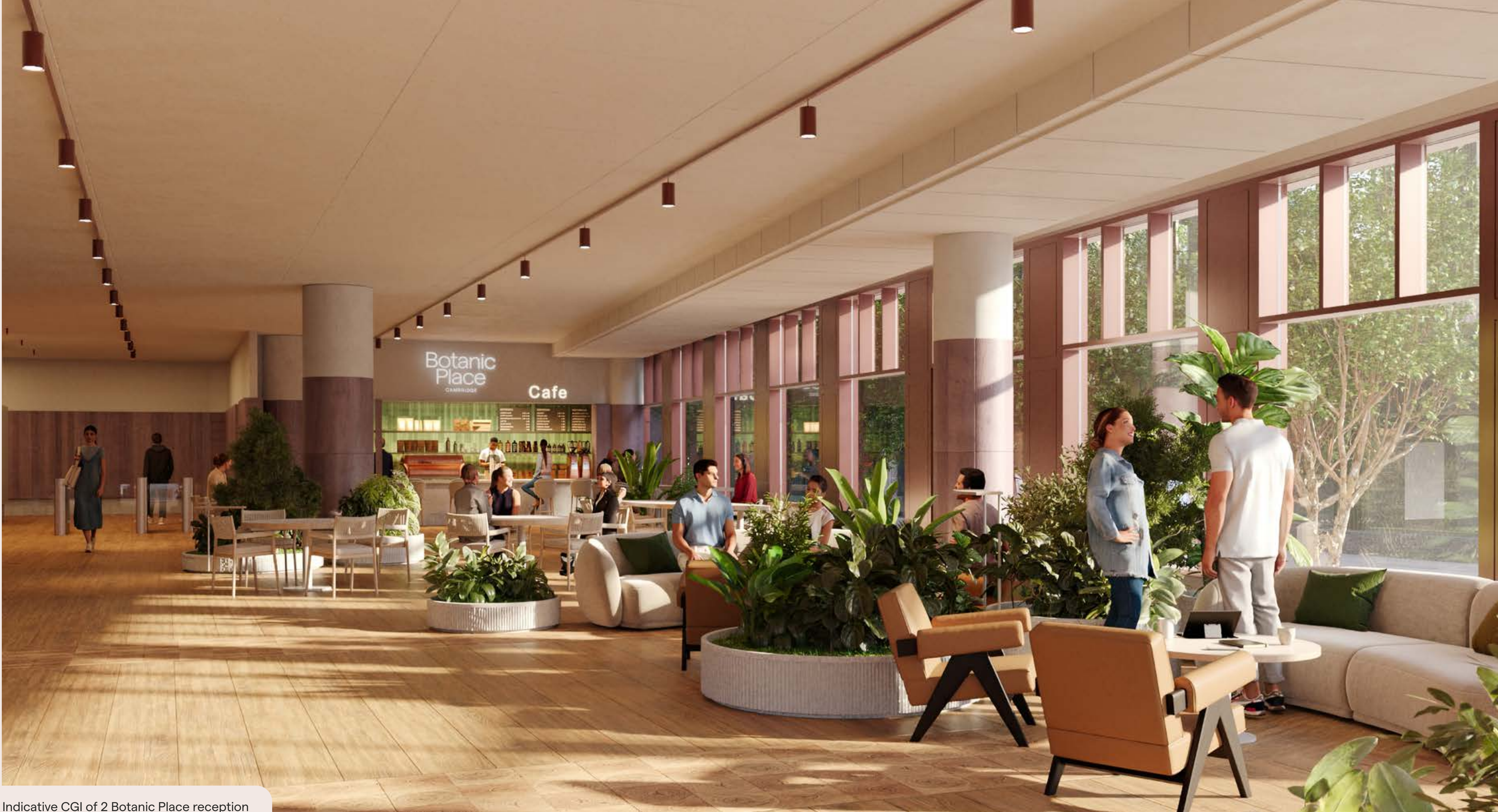
Indicative CGI of 2 Botanic Place reception