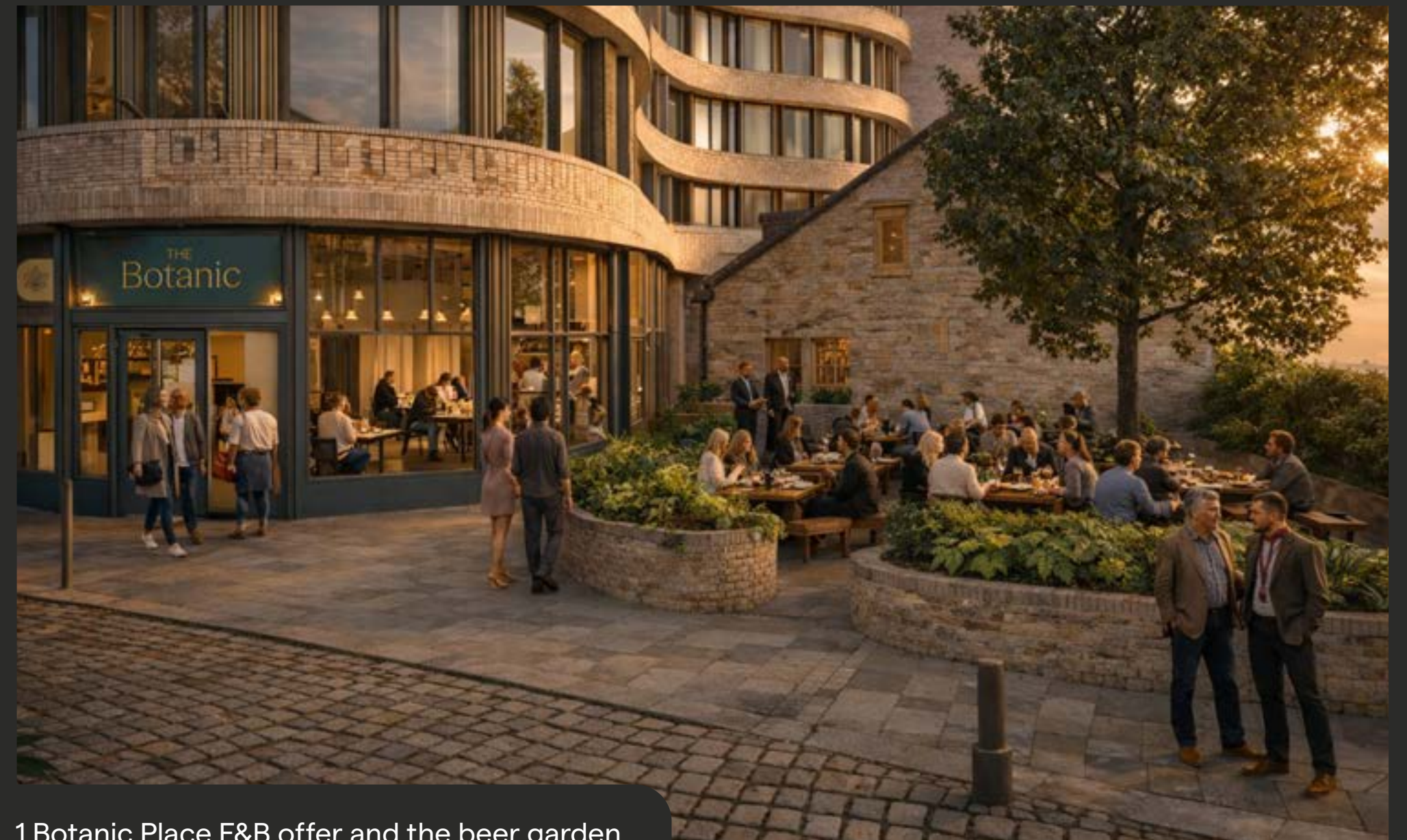
1 Botanic Place F&B offer and the beer garden