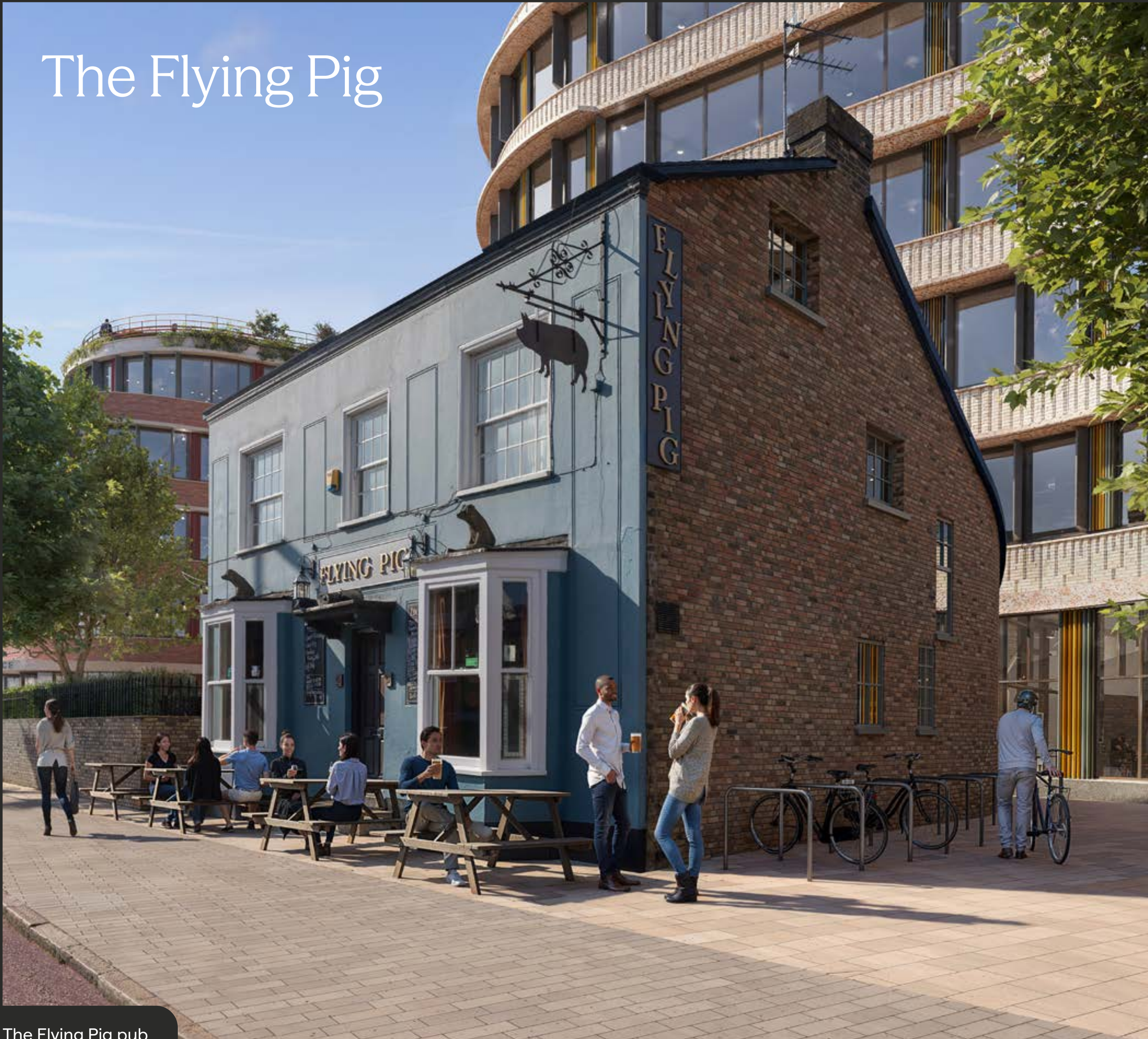
The Flying Pig pub