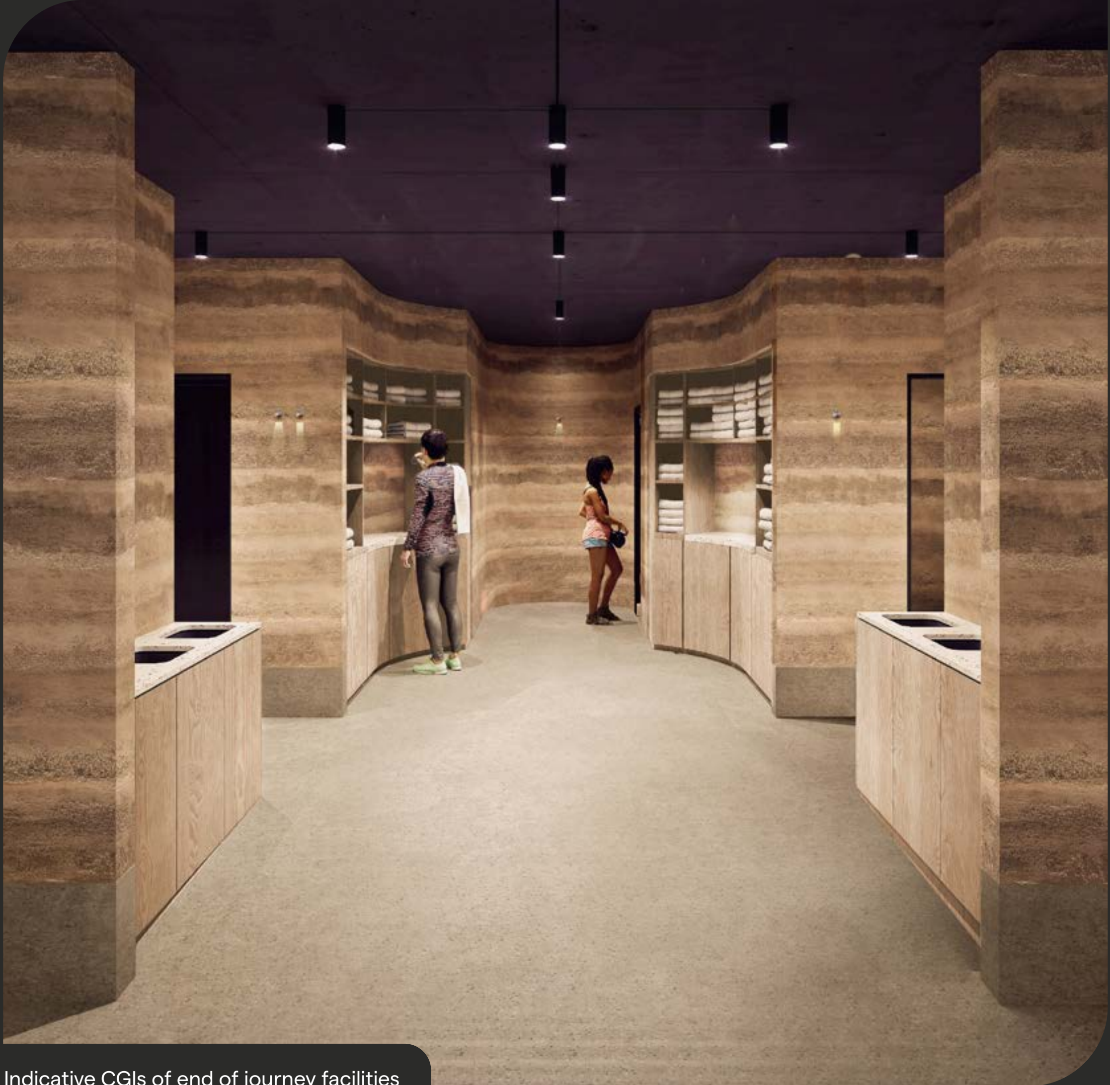
Indicative CGIs of end of journey facilities