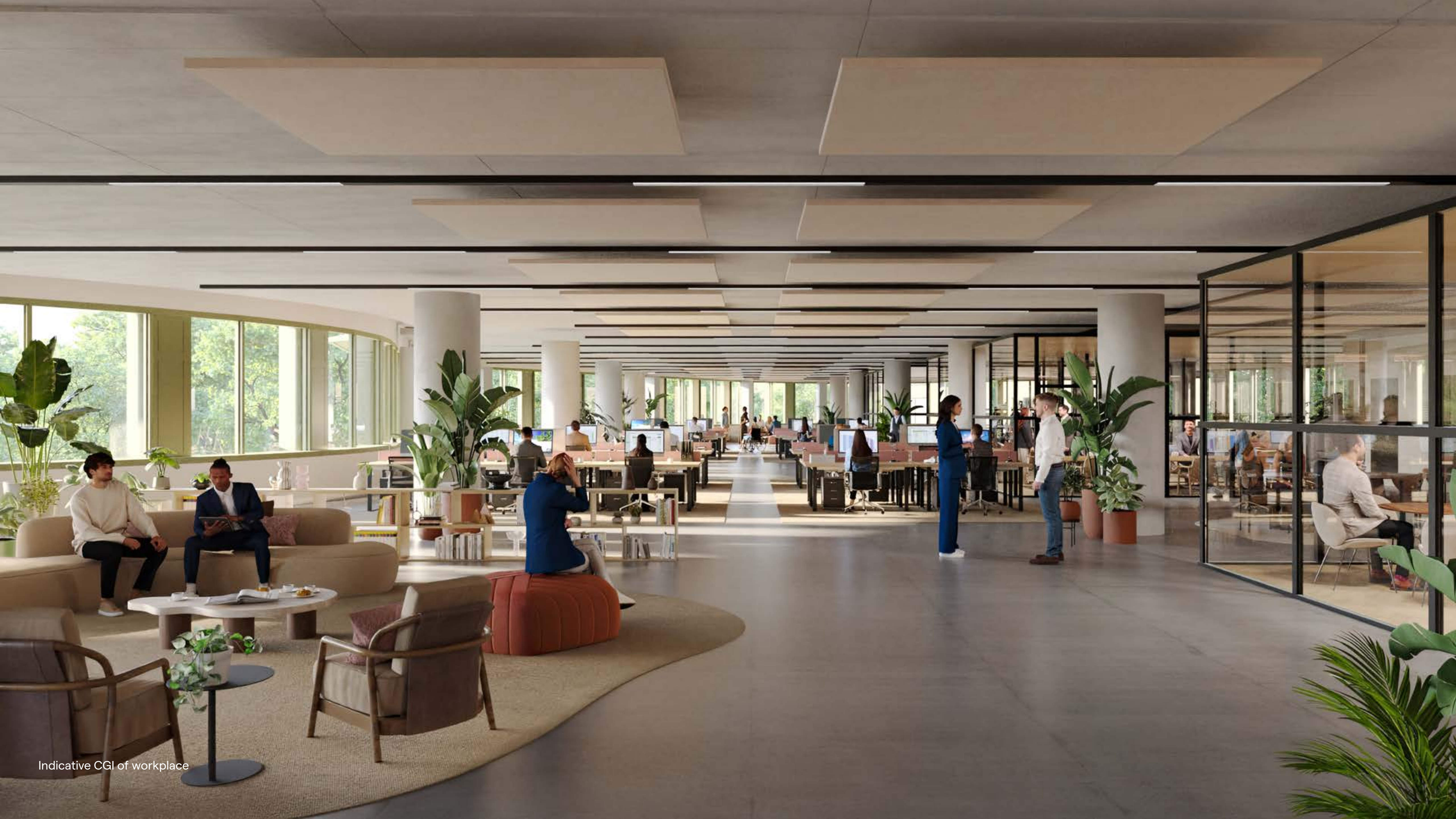
Indicative CGI of workplace